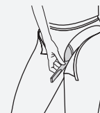
4. Using the Whiz without undressing

Important: The Whiz ® must be held correctly. The broad area of the opening must be uppermost and held snugly against the body. Its unique lily shape was tested by over 1,400 women in clinical trials and since used successfully by many thousands of women of all ages, from all walks of life. Held correctly the Whiz will not leak and stays completely dry on the exterior. Remember to keep the nozzle pointed downward and away from the body. Do not share a Whiz with others.