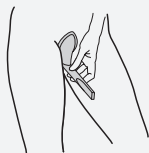
1. Hold the Whiz snugly against the body as shown

You will be amazed at what difference such a small device can make to your quality of life.