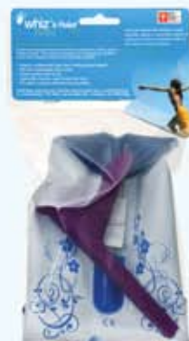
Combo Pack: freedom & Relief Bag