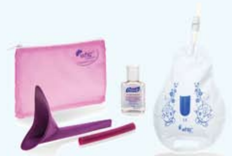
Ultimate Pack: Whiz ® freedom + Whiz Bag + Relief Bag, 10cm Tubing + 15ml Hand Sanitizer