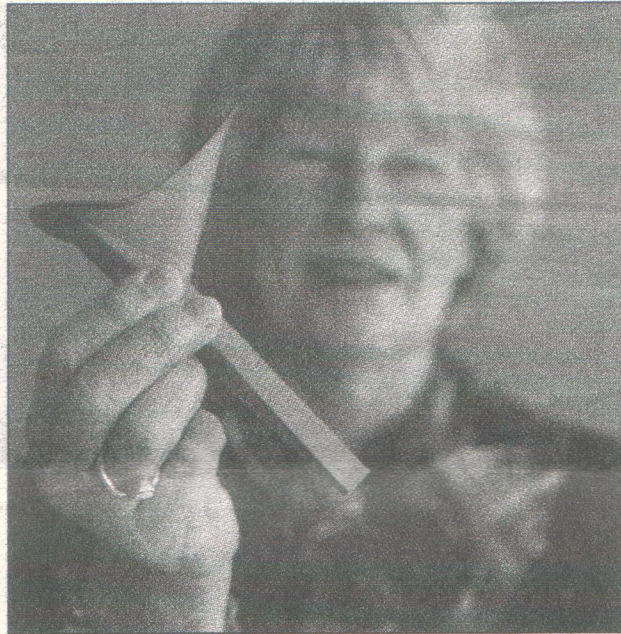
IN THE PINK: The Whiz

The mother-of-one came across the device while recovering from a hysterectomy and suffering severe bladder control problems and can't praise it enough.